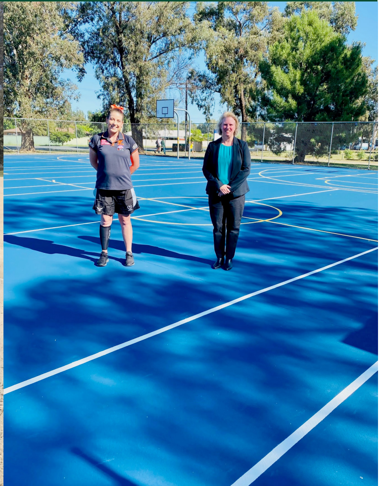
Above: Basketball Court Transformation (Before and After) Below: Year 9/10 Timber students restoring benches for Kiltarn House