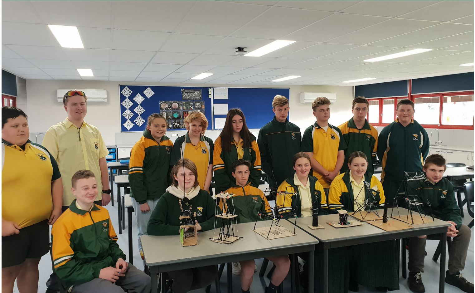
Above: Students and the towers they built for the Earthquake Challenge