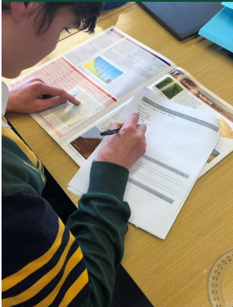
Top Left: Year 12 Geography