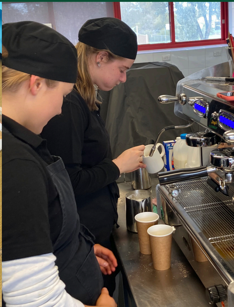
Top Right: Year 12 Hospitality

Commerce and Elective History, and senior Business Studies, Ancient History, Modern History, Legal Studies, Geography and Marine Studies. Our focus is on developing a love of learning in our students; inspiring them to become critical and creative thinkers for our modern world with a solid understanding and appreciation of community, social justice and environmental issues.