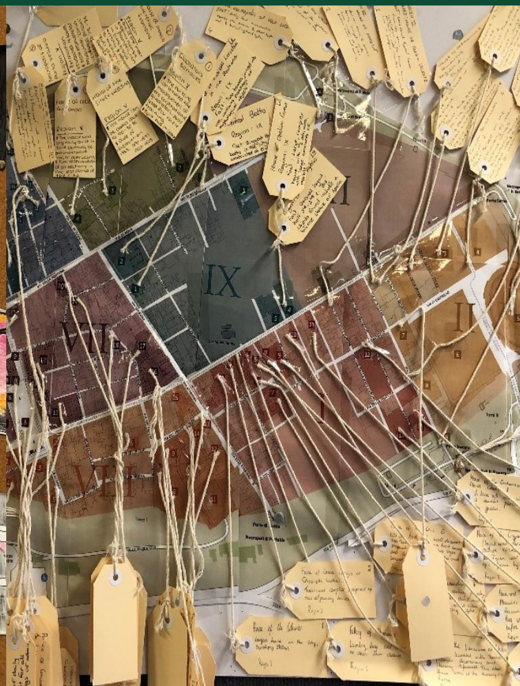
Top Right: Year 12 Ancient History