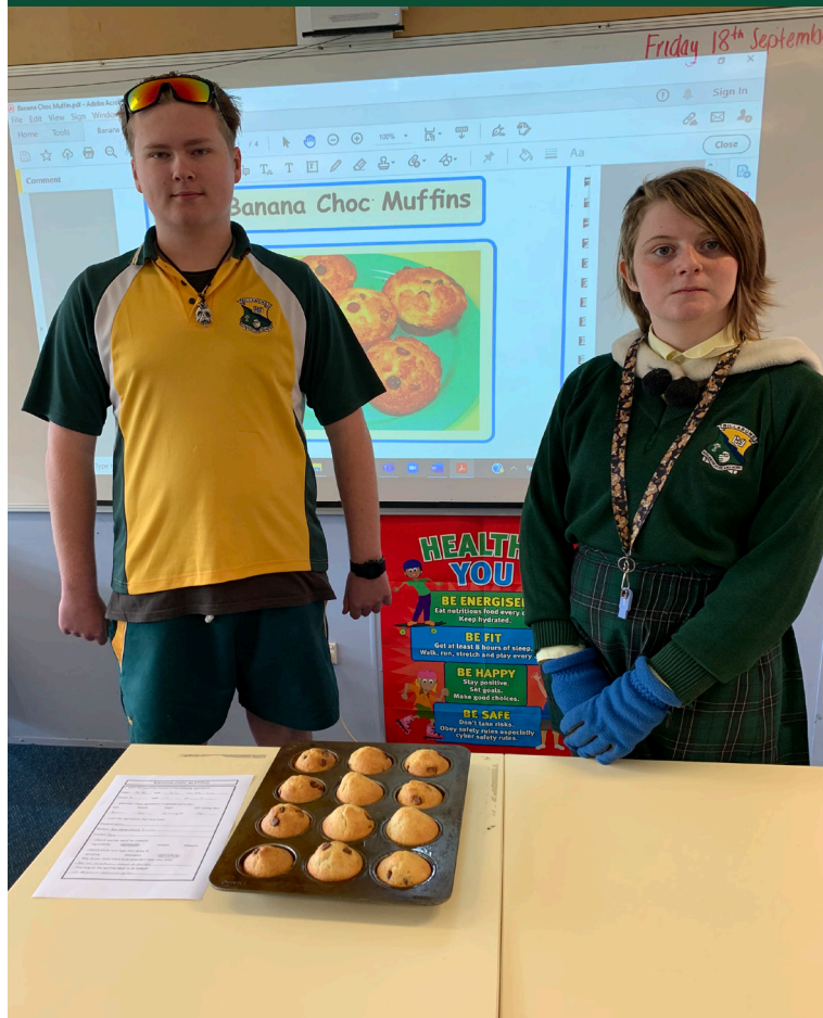
Above Left: Students with their Banana Choc Muffins