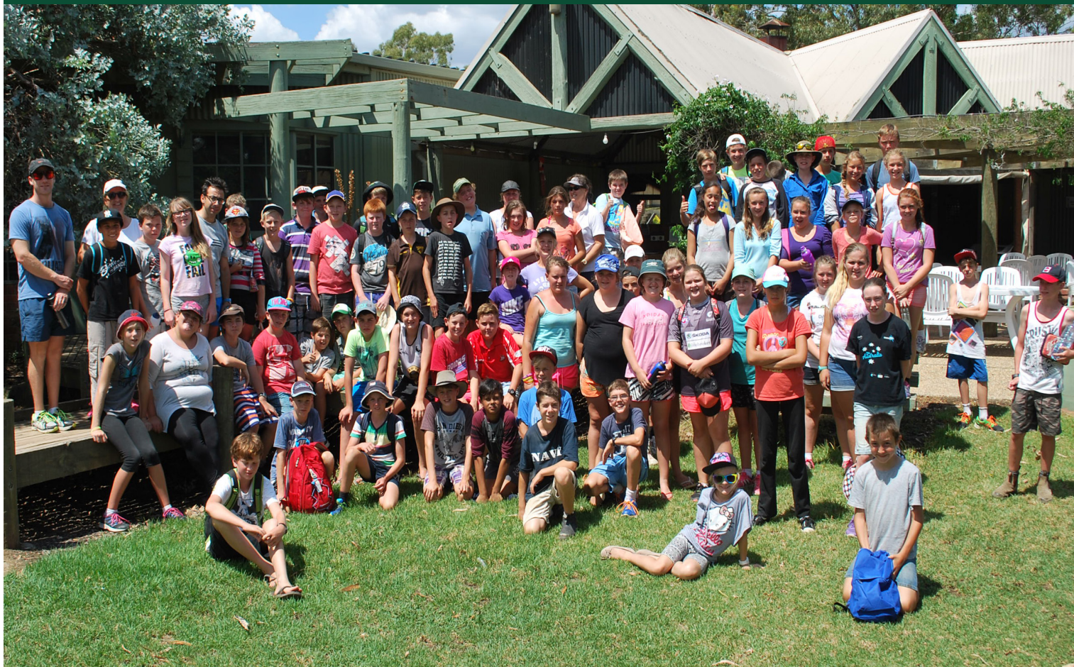
This week we farewell our Year 12 Students many of whom have been with us since 2015 Above: Year 7 Camp 2015 Below: Year 10 Formal 2018