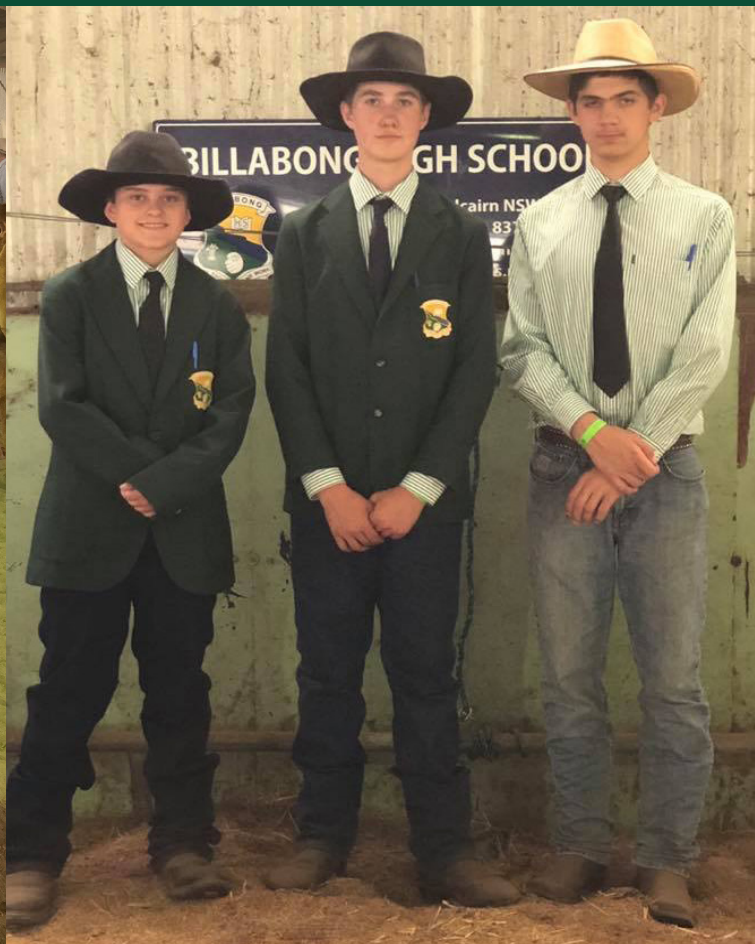
Albury Show Agriculture Team