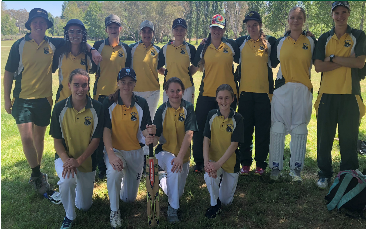
Above: Marie Cornish Girls Cricket Finals in Tumut Below: School Spectacular