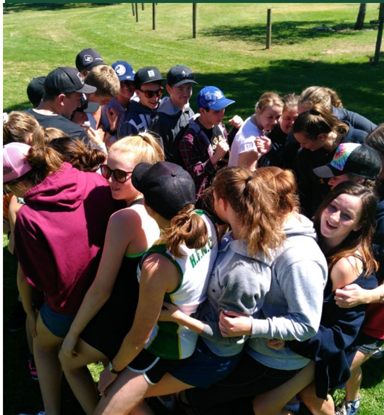
Peer Support Camp