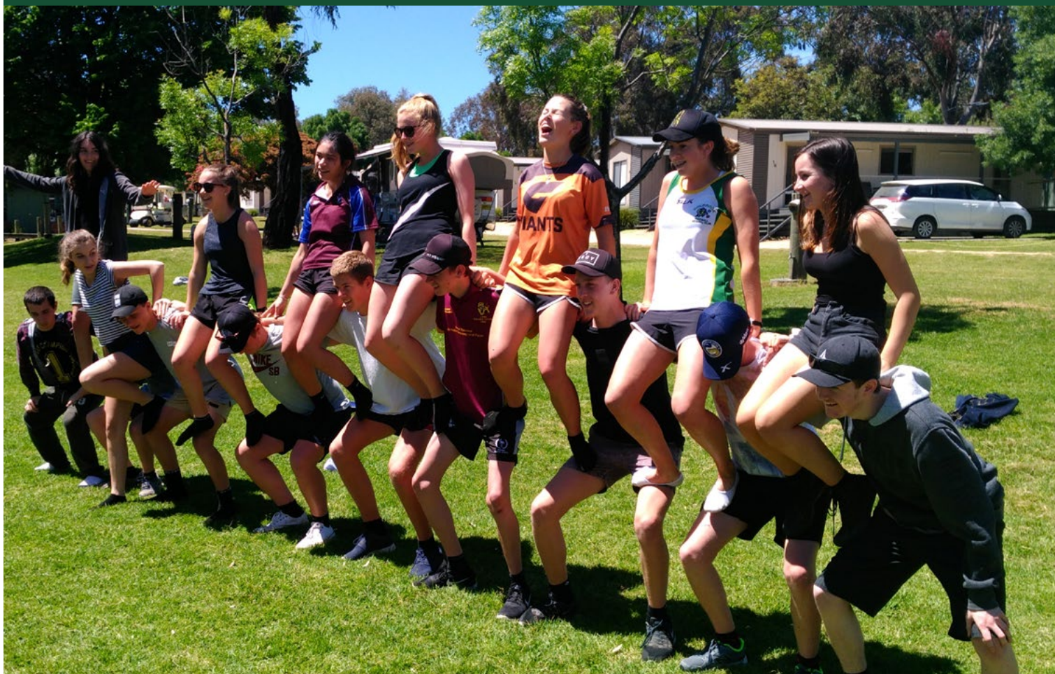
Peer Support Camp