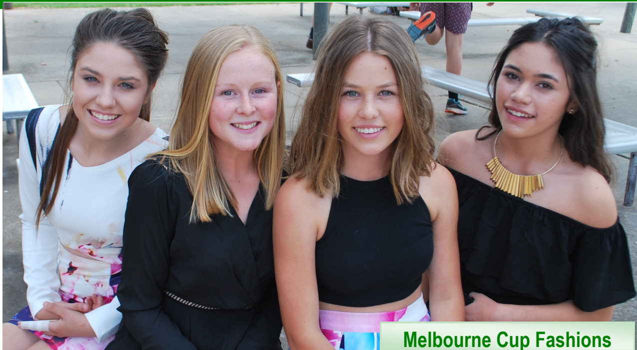
Melbourne Cup Fashions