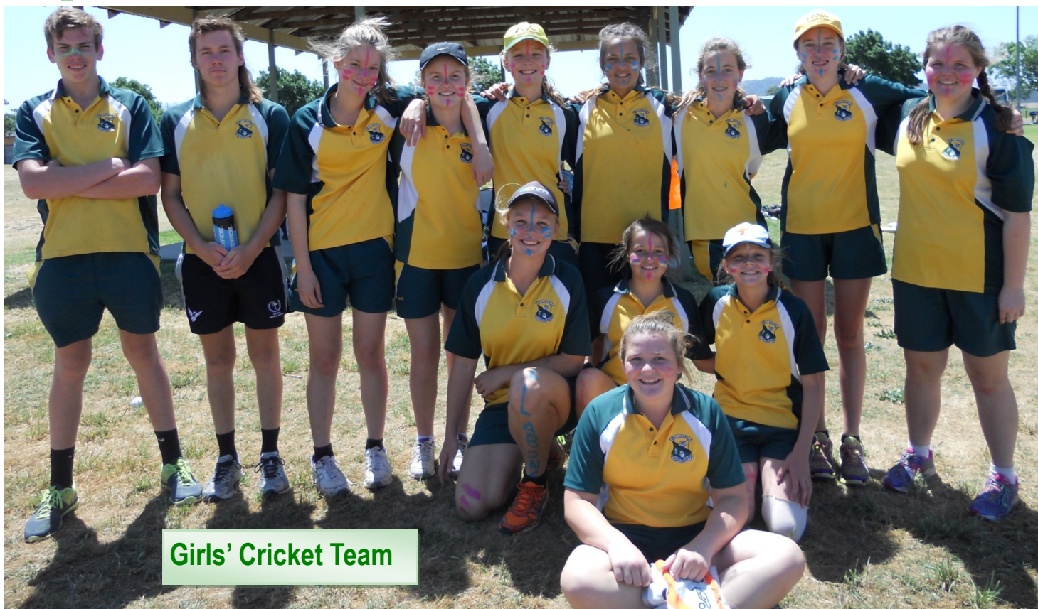
Girls' Cricket Team